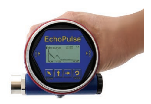
Echo Signal Return Curve Shown

- 20 2" (48mm) 5.51" (140mm) 3" (78mm) 8.94" (227mm) 11.34" (288mm) 4" (98mm)