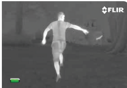
Assailant trying to dispose of evidence

No matter how clever a suspect may be, they can't hide their heat. Rather than rush on the scene with a flashlight that instantly gives away your position and only illuminates your immediate area, FLIR LS is just as portable, and exponentially more effective. Search the scene for discarded evidence in pitch black conditions where traditional night vision fails. You can see through smoke, dust and light fog. Even light foliage and camouflage are powerless against thermal imaging. Take away every hiding spot with FLIR LS Series.