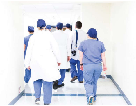
Medical & Healthcare