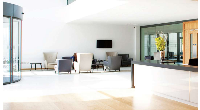
Clinics / Laboratories