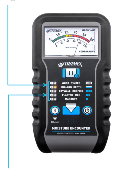
Scales 3, 4 and 5 have a preset sensitivity appropriate to the density of the materials indicated.

Scales 1\,\mbox{and}\,2, when used with wood, will give a \%\mbox{MC} reading.