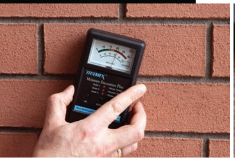
Find Quality Products Online at: