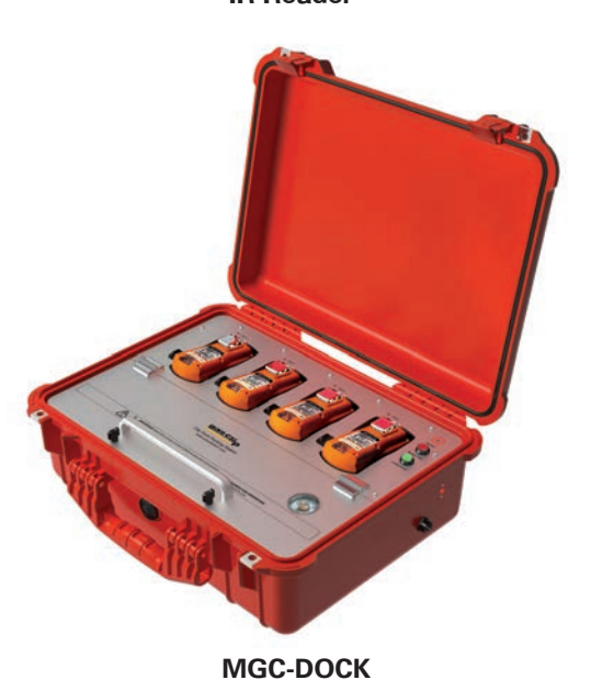
Part # Description MGC 4 Gas Monitor with infrared sensor MGC-P 4 Gas Monitor with pellistor sensor MGC-DOCK 4 bay calibration and bump test station GCT-IR-LINK GCT IR communication module w/ USB cable MGC Confined Space Kit (monitor and gas sold separately) Please contact Gas Clip Technologies for additional spares, accessories and gas.