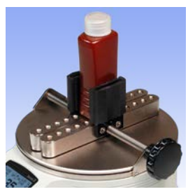
CT001 Flat jaws Set of rubber jaws for gripping square or odd shaped containers.