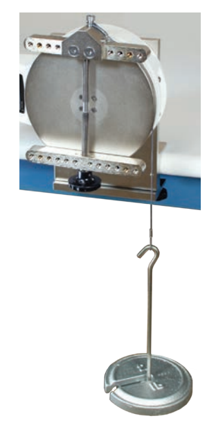
Calibration kit Complete set of brackets, cable, and hardware for calibration of any Series TT01 torque tester. Weights not available from Mark-10.