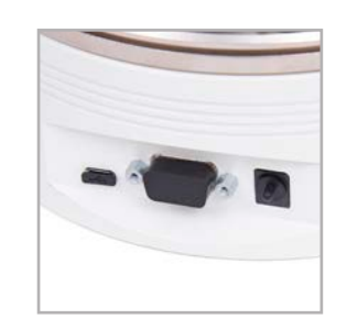
AC1077 Connector cover kit

1.25" (31 mm), 2.5" (63 mm), and 4" (101 mm)