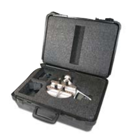
CT002 Carrying case Provides storage space for the TT01 tester, gripping jaws, AC adapter, and accessories.