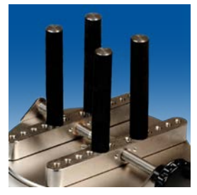
CT005 / CT006 / CT007 Extended length post sets

CT005: Four 2.5" (63 mm) posts CT006: Four 4" (101 mm) posts CT007: Kit of four of each length: