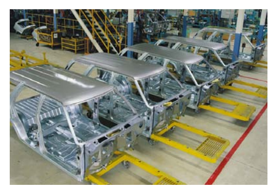
From paint curing to thermoforming, noncontact temperature measurement provides consistent product quality in the automotive industry.