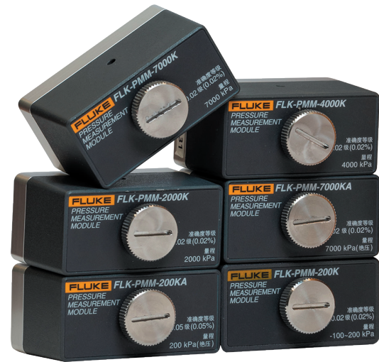
Figure 1. Rechargeable lithium battery with capacity indication.

HART communication enables mA output trim, trimmed to applied values, and pressure zero trimming of HART pressure transmitters. You can easily change a transmitter tag, measurement units and ranges. Other supported HART commands include setting fixed mA outputs for troubleshooting, reading device configuration parameters and reading device diagnostics.