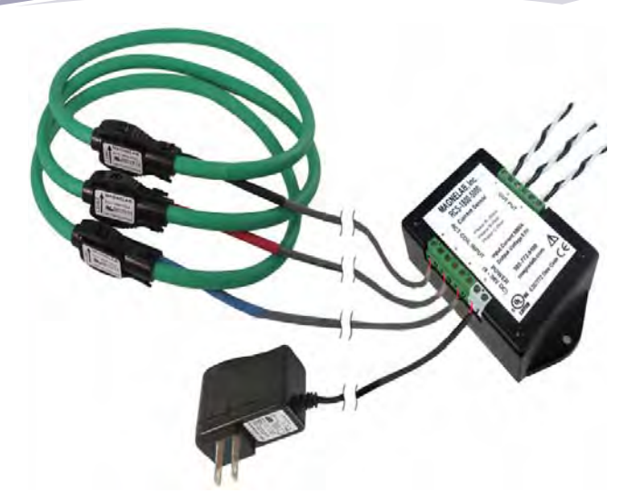
Optional Power Supply shown