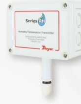
OSA (outside air) with sintered filter