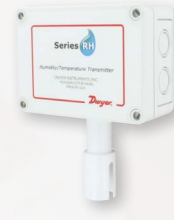
OSA (outside air)