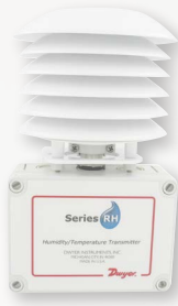
OSA (outside air) with radiation shield