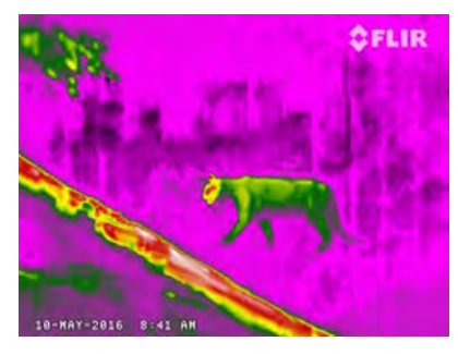
Rain: Well-suited for low-contrast scenes

This product is subject to United States export regulations and may require US authorization prior to export, reexport, or transfer to non-US persons or parties. Diversion contrary to US law is prohibited.