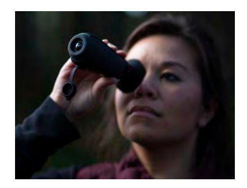
STAY AWARE, STAY SAFE Use for personal home security at night