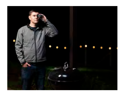
EXPLORE LIKE NEVER BEFORE