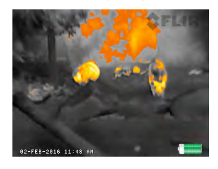
Graded Fire 1&2: The hottest things in the image are shown in a gradient of color while everything else is greyscale