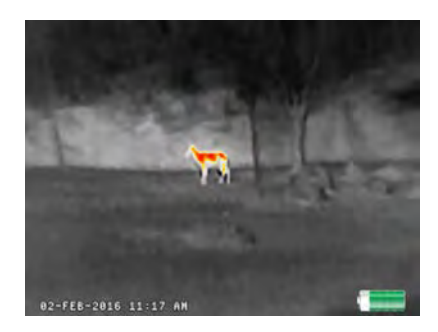
InstAlert: The hottest object in the image is colored while everything else is greyscale