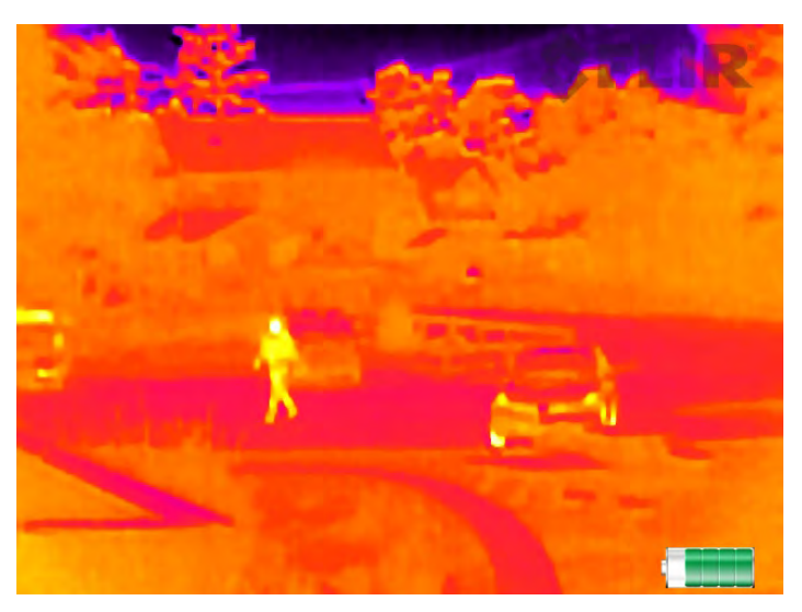
The FLIR Scout TKx helps you stay aware in the dark of night

The FLIR Scout TKx is a pocket-sized thermal vision monocular for exploring the outdoors at night and in lowlight conditions. This thermal monocular with an extended battery life reveals your surroundings, allowing you to clearly see people, objects, and animals from more than 90 meters (100 yards) away. The Scout TKx records thermal images or video in multiple color palettes that can enhance viewing, including InstAlert<sup>TM</sup>—a greyscale palette that adds color to highlight the hottest object in the scene. Simple to use, the Scout TKx is the perfect companion, whether in the countryside or on your own property.