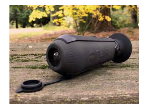
GRAB AND GO SIMPLICITY

Starts up in seconds, no training required