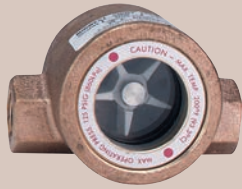
Model 100, 100MP