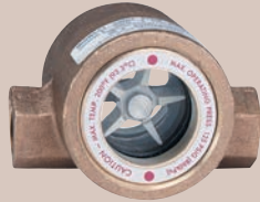
Model 300, 300MP