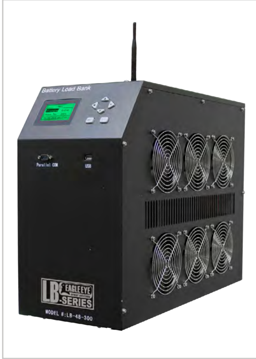
SLB-Series DC Load Bank