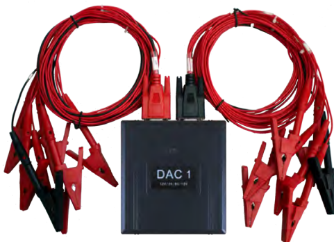
Data Acquisition Case (DAC)

Eagle Eye's SMART Load Banks come with an optional DAC package allowing the voltage of EACH CELL to be wirelessly recorded and displayed during discharge. The DAC package allows the user to evaluate the health of each cell and replace only the cells that require replacement - saving time and money by significantly reducing labor hours and replacement costs.