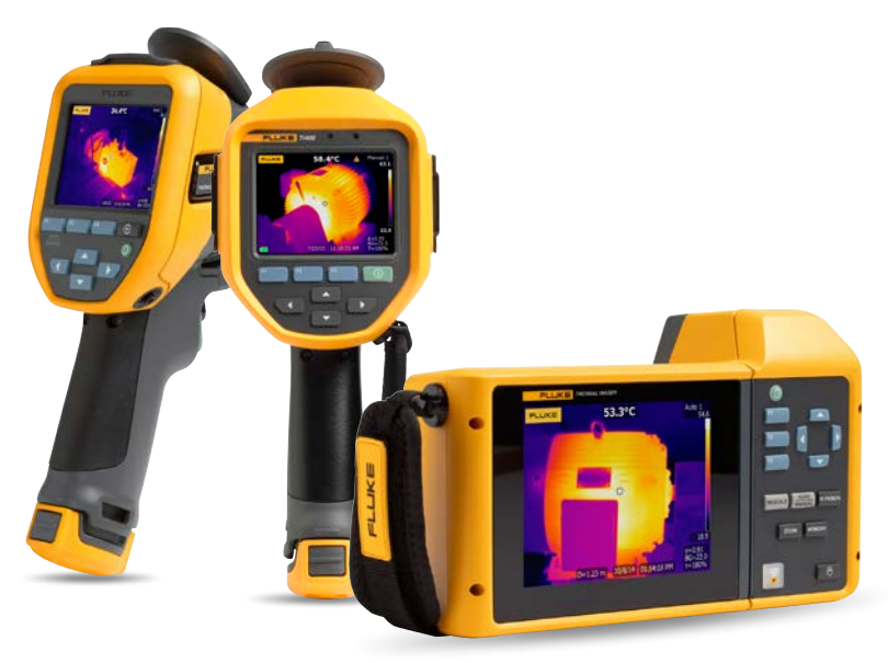
*For PPE guidelines, reference NFPA (National Fire Protection Association) Standard 70E Tables 130.7 (c)(9)(a), (c)(10), (c)(11).

For oil-filled transformers, use a thermal imager to look at high- and low-voltage external bushing connections, cooling tubes, and cooling fans and pumps, as well as the surfaces of critical transformers. (Dry transformers have coil temperatures so much higher