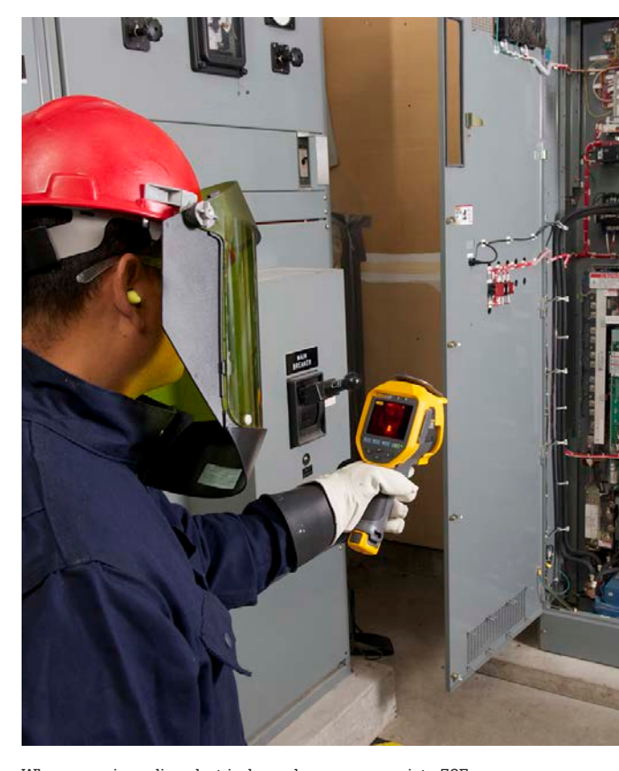
When scanning a live electrical panel, wear appropriate 70E personal protective equipment for arc flash and stand at least four feet away.

Objects that have high emissivity emit thermal energy well and are not usually very reflective. Materials that have low emissivity are usually fairly reflective and do not emit thermal energy well. This can cause confusion and incorrect analysis of the situation if you are not careful. A thermal imager can only accurately calculate the surface temperature of an object