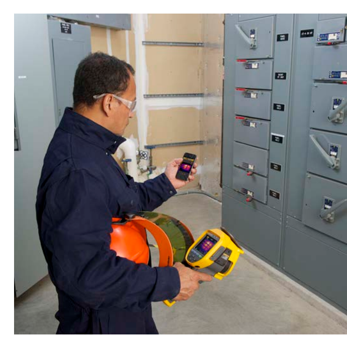
Create an inspection report while still at the inspection site and communicate directly to your client or manager via your Apple®, iPhone® or iPad®

than ambient, it's difficult to detect problems with thermal imagery.) Incorporate the guidelines above for connections and imbalances. The cooling tubes should appear warm. If one or more tubes is comparatively cool, oil flow is probably restricted. Keep in mind that like an electric motor, a transformer has a minimum operating temperature that represents the maximum allowable rise in temperature above ambient (typically 40 °C). A 10 °C rise above the nameplate operating temperature will probably reduce the transformer's life by 50 percent.