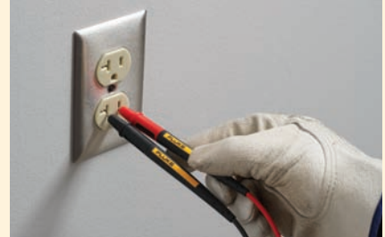
Increase tip exposure for CAT II probing