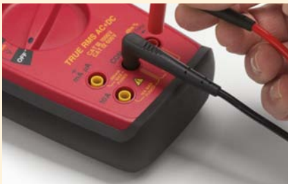
Universal plugs compatible with all 4 mm shrouded inputs