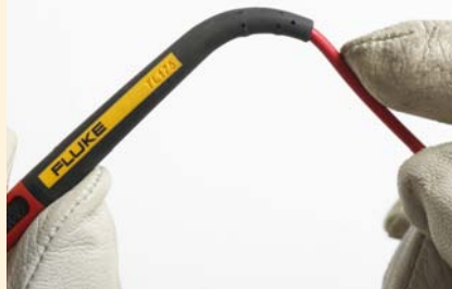
Extreme strain relief tested to withstand over 30,000 bends