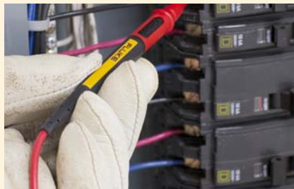
Reduce tip exposure for CAT III testing