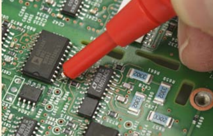
Reduce tip exposure for accurate placement