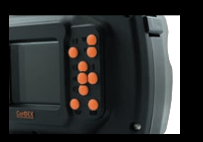
Soft touch buttons for ease of use