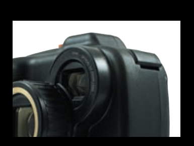
Powerful LED flash for low light imaging