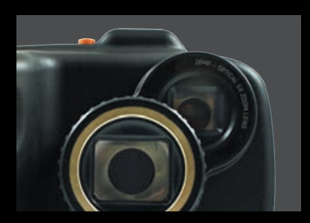
Fully featured compact digital SLR

Forget delicate touch screens and small buttons. Your job requires gloves to perform and your camera needs to perform with gloves.