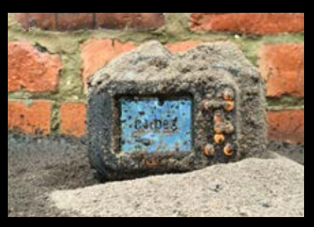
Tough, like you

Take and review images in any weather, day or night in complete confidence.