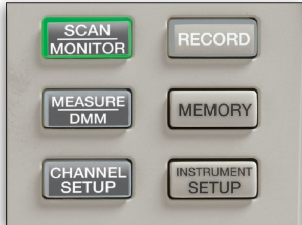
Scan, monitor, measure, and DMM function keys on the front panel.

Function keys are backlit so that you always know the mode of operation and recording status.