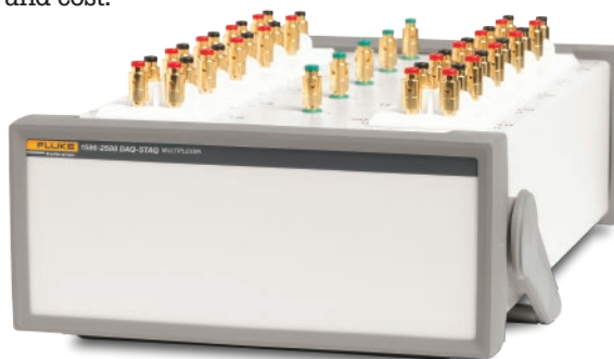
1586-2588 DAQ-STAQ Multiplexer Designed for high-accuracy measurements in secondary temperature calibration labs. Easily connect/disconnect thermocouples, PRTs, and