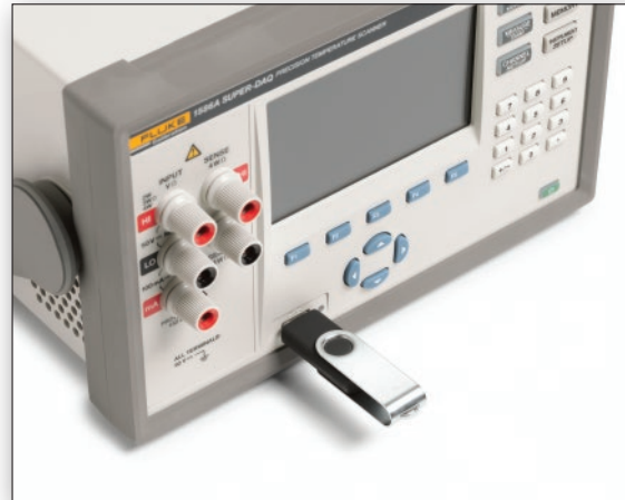
Easily transfer Super-DAQ data and setup files using a USB flash drive.

The Super-DAQ also includes two levels of data security to prevent unauthorized users from tampering with or forging test data or setup files. This security feature is especially important to industries that are regulated by government agencies where data traceability is required.