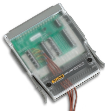
1586-2586 High-Capacity Module Universal input channels accepts 2-, 3-, or 4-wire connections to measure temperature, resistance, dc voltage, and dc current for

For a calibration lab where accuracy is of primary importance, the Super-DAQ is best configured with a DAQ-STAQ Multiplexer. The external DAQ-STAQ features mini-jack thermocouple terminals—each with its own reference junction sensor—and patented mini-DWF, gold-plated input terminals, which accept bare wire, spade lug, or mini-banana-plug probe terminations. Easily connect and disconnect PRTs, thermistors, and thermocouples for benchtop temperature calibration. It can be stacked on the 1586A to reduce footprint in busy labs. Having the flexibility to configure the Super-DAQ for factory or lab use reduces your equipment needs and cost.