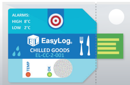
EL-CC-2-001 PK10 (Pack of 10) T/RH - Chilled Goods EL-CC-2-002 PK10 (Pack of 10) T/RH - Frozen Goods EL-CC-2-003 PK10 (Pack of 10) T/RH - Ripening Goods