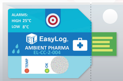
EL-CC-2-004 PK10 (Pack of 10) T/RH - Ambient Pharma EL-CC-2-005 PK10 (Pack of 10) T/RH - Blood Transportation EL-CC-2-006 PK10 (Pack of 10) T/RH - Platelets Transportation